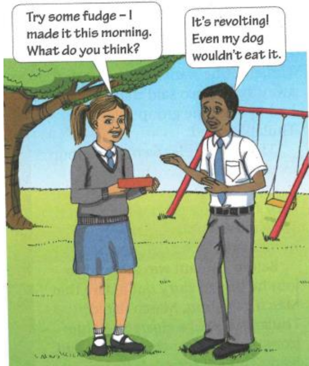
Source 1: Oxford Successful Grade 5 Life Skills Learner's Book, page 20